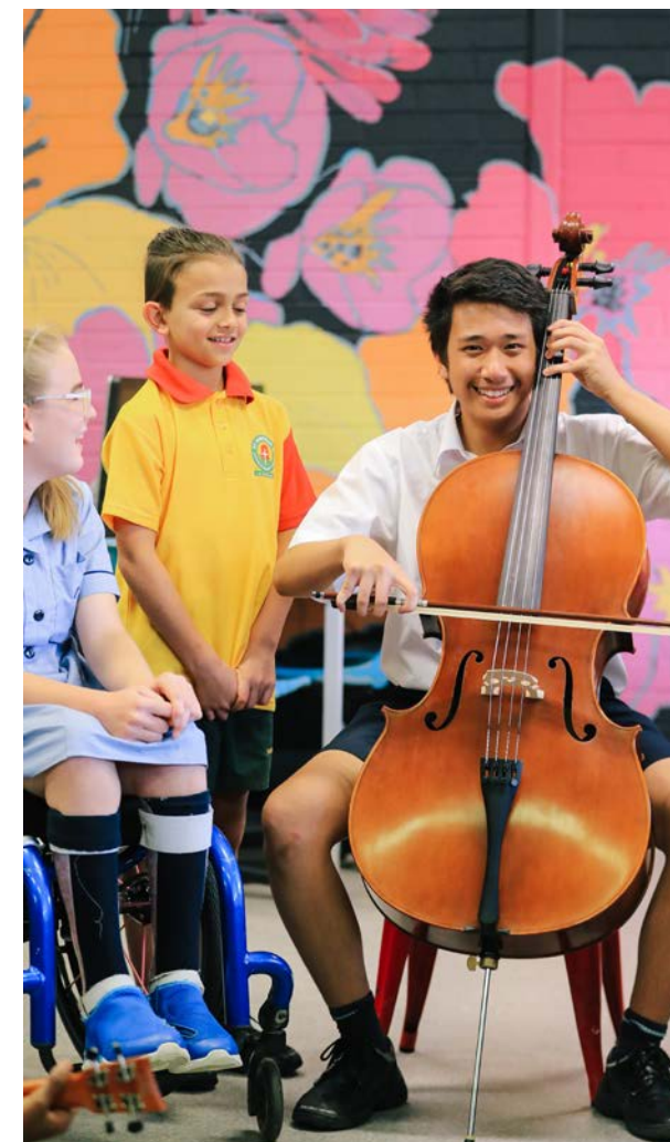
Photo: Mater Dei College (Edgewater), St John Paul II Catholic Primary School (Banksia Grove)

Unpredictable events are just that – unpredictable. Setting aside an annual allocation would deprive other projects of funding, and should no circumstance arise before the termination of the CAF program in 2029, then CEWA is faced with the prospect of having to allocate these accrued funds to projects at relatively short notice which is undesirable. CEWA is confident that existing crisis management processes across all aspects of school operation, currently exist. Further, CEWA is confident that these emergency processes can be activated immediately, including funding allocations under CAF.