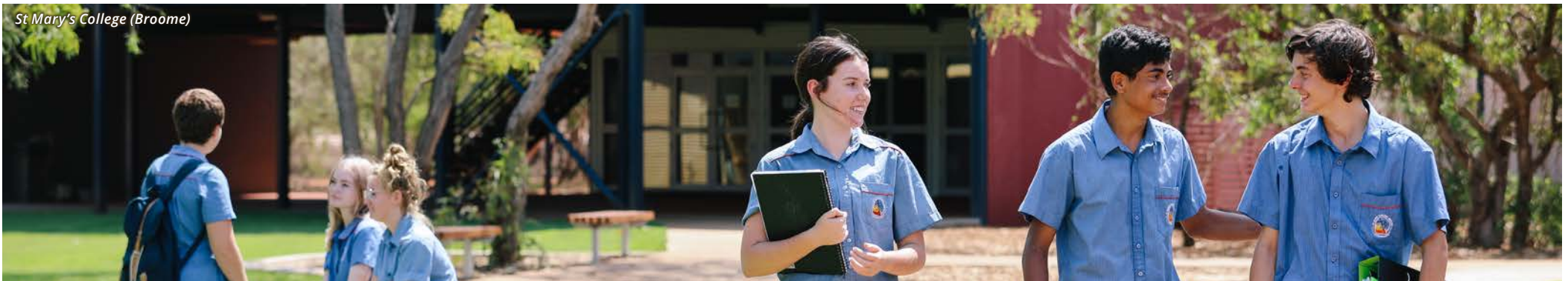
St Mary's College (Broome)