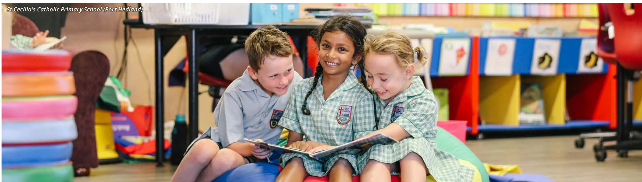
St Cecilia's Catholic Primary School (Port Hedland)