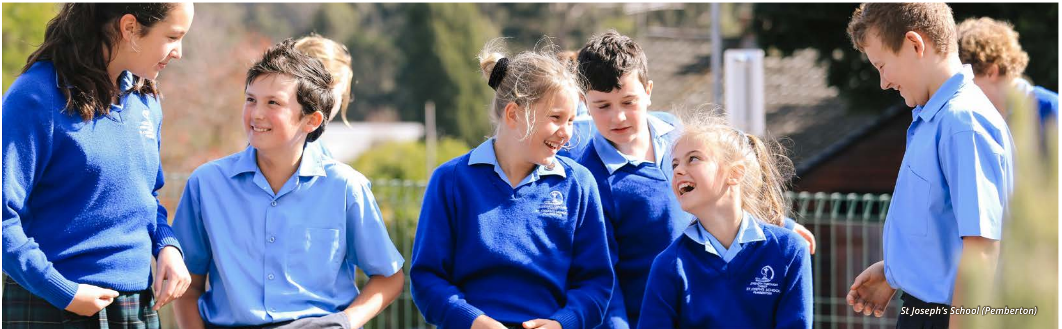
St Joseph's School (Pemberton)

CEWA recognises that some non-diocesan schools may be adversely affected by the DMI funding model in 2022 and 2023, and may be seeking Transition Assistance. CEWA will convene a meeting of adversely affected non-diocesan schools in 2022 to determine appropriate support that might be required after an assessment of their context. Potential support would be provided from the accumulated Transition Assistance funds. CEWA will advise DESE of any allocations proposed for 2022 and 2023 and the adjustments that might be required to subsequent CAF budgets.