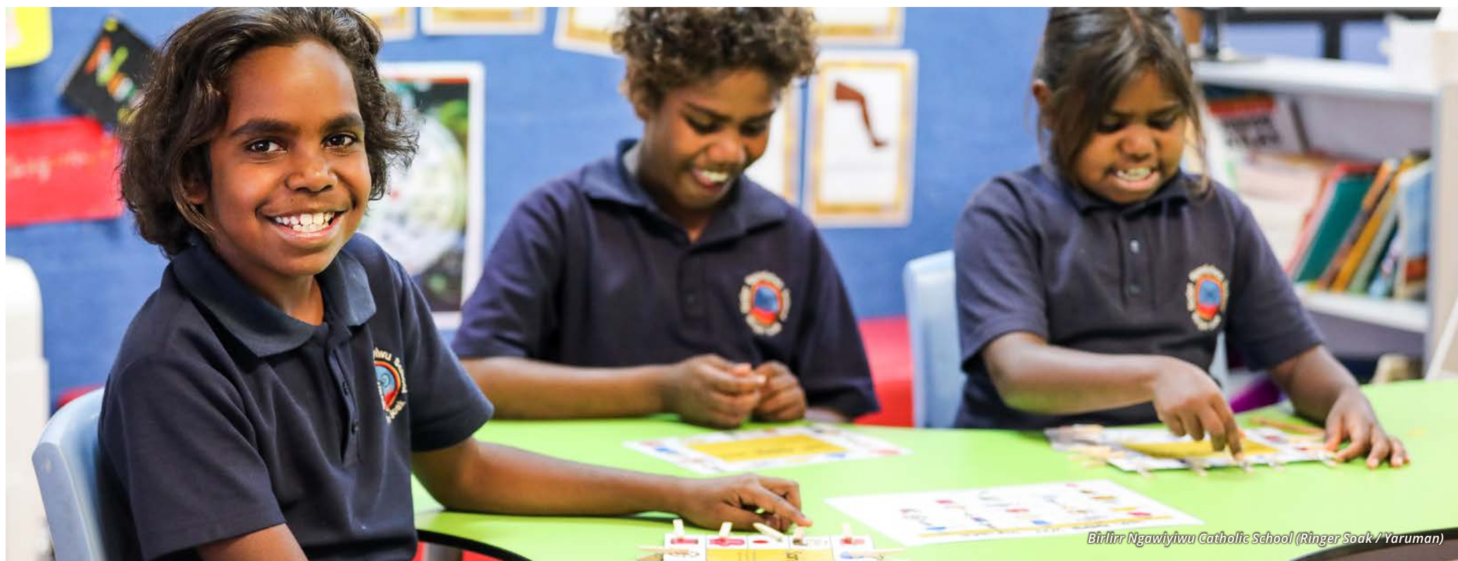
Birlir Ngawiyiwu Catholic School (Ringer Soak / Yaruman)