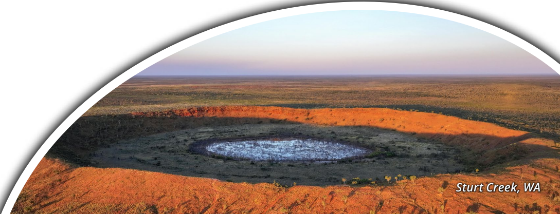
Sturt Creek, WA