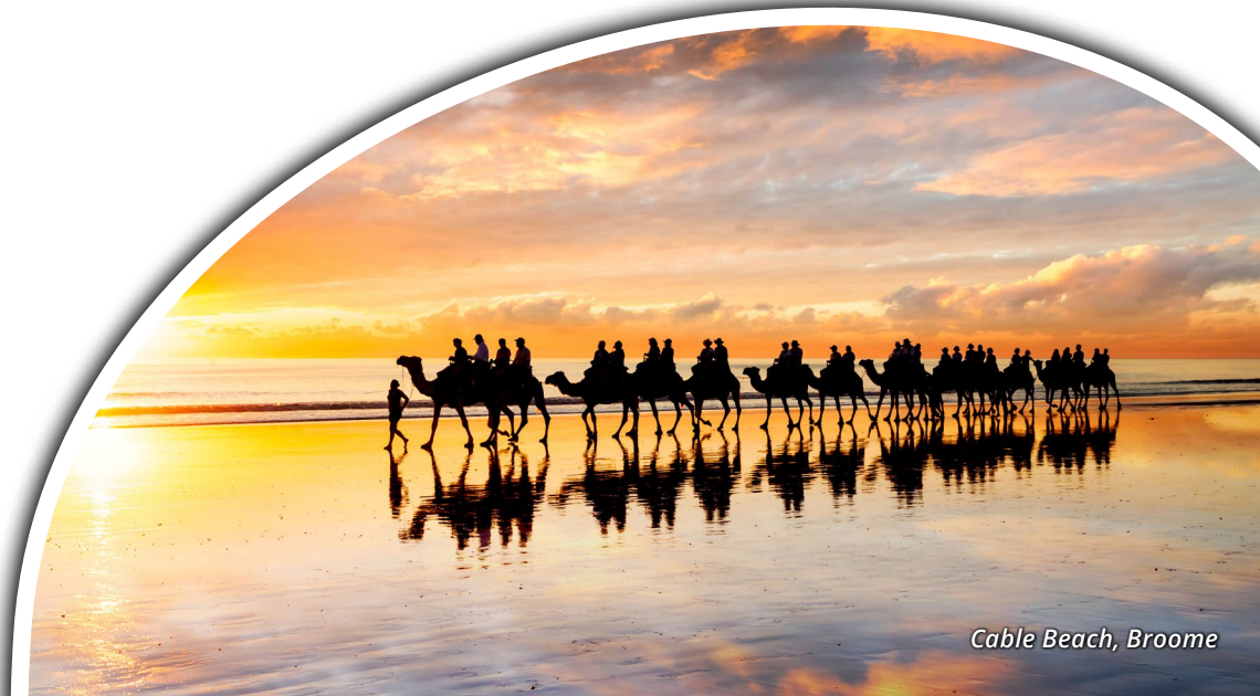
Cable Beach, Broome