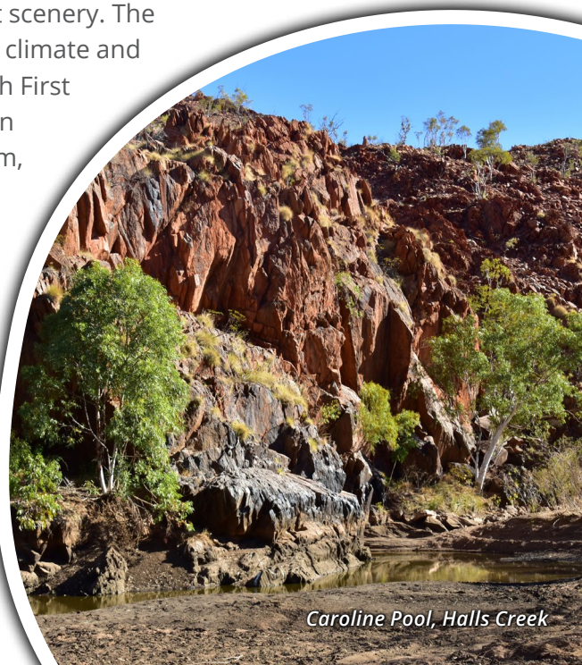
Caroline Pool, Halls Creek

Teaching in Halls Creek, Western Australia, offers a distinctive and fulfilling lifestyle. Located in the heart of the Kimberley, Halls Creek is surrounded by striking landscapes, including ancient gorges and stunning red desert scenery. The town features a warm, outback climate and a close-knit community with rich First Nations heritage, while the town recreation centre includes a gym, swimming pool, and basketball courts. Educators can enjoy unique outdoor adventures such as exploring local rock formations, hiking, and cultural experiences while making a significant impact on students' lives. Halls Creek provides a blend of professional growth and an immersive experience in a remote setting.