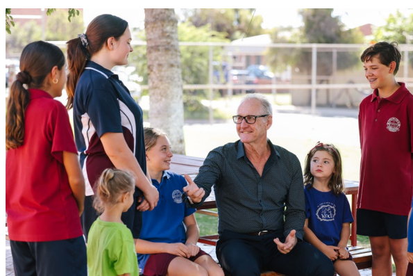
St Mary Star of the Sea College, Carnarvon