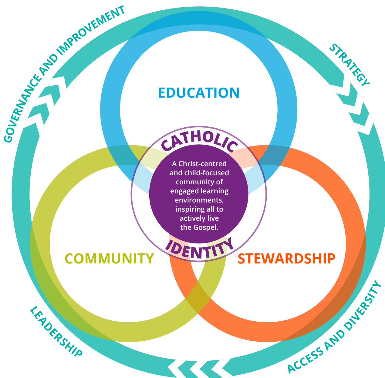
QCE Conceptual Framework

QCE is a whole of system approach to addressing the important governance and improvement processes and structures, and thus is an elaboration on CEWA's vision of a quality Catholic education which is Christ-centred and child-focused. The leadership programs and networks outlined in this booklet are fundamentally underpinned by the QCE Elements.