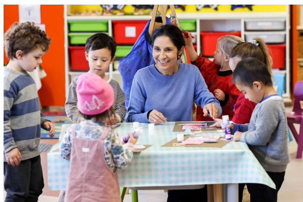
St Patrick's Primary School, Fremantle

ACCREDITATION FOR LEADERSHIP (IN-SERVICE)